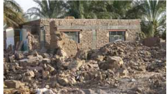
Fig. 1 Collapsed adobe house as a result of the 2003 Bam earthquake

The models were subjected to unidirectional sinusoidal excitations (parallel to the walls with openings) with amplitudes and frequencies varying from 0.05 to 1.4g, and from 35 to 5Hz, respectively. Figures 3 and 4 show the typical input waveform and