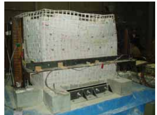
Fig. 7 Retrofitted model after Run 61