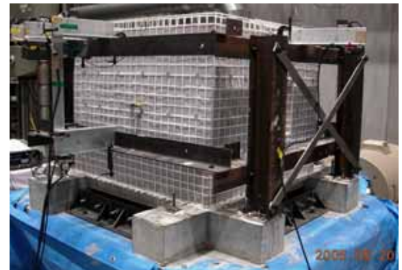
Fig. 2 Test setup