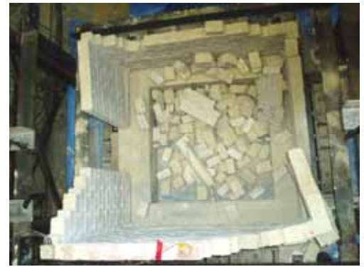
Fig. 5 Non-retrofitted model after Run 46