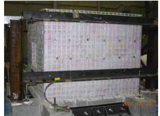
Fig. 6 Retrofitted model after Run 46