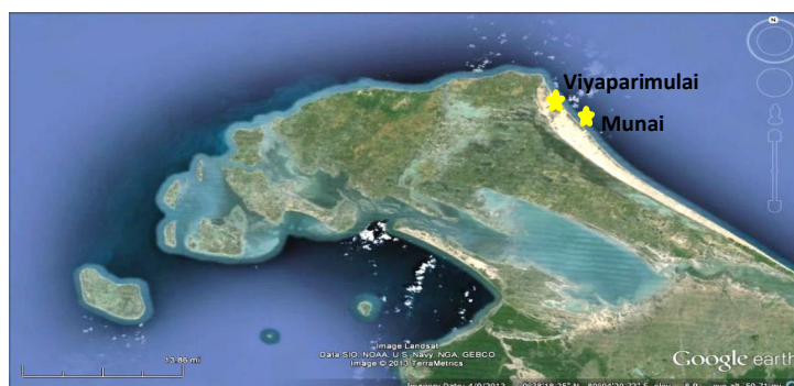
Fig. 1. Location of the study sites in coastal areas of Point Pedro Sample identification

This study was carried out during the period from May 2014 to June 2015. Two study sites were selected viz. , Viyaparimulai (N 9°49.912' E 80°13.517') and Munnai (N 09°49.659' E 80°14.889') (Fig. 1). Transects of 4 m width and 100 m length were made by direct visual assessment method on a monthly basis for the estimation of density and diversity of species at the two stations. using six replicates. Each transect was separated by a minimum distance of 5 m and data collections were carried out during low tide time only. The data obtained through the study were analysed with several diversity indices such as species richness, abundance, Shannon index and the Evenness index using PAST Software version 2.17c.