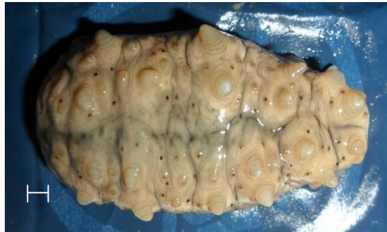
Fig. 4. Stichopus horrens

Colour of S. horrens is grey with greenish white (Fig. 4). Upper dorsal surface is covered with wart like papillae in two rows. Large podia occur along the lateral line of ventral surface. Ventral mouth is surrounded by half rows of papillae, and contains 18 green tentacles. Cuvierian tubules are absent and calcareous ring is characterised by triangular interradials.