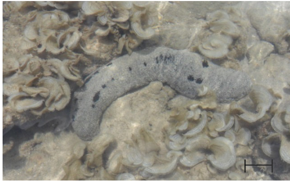
Fig. 2. Holoturia atra