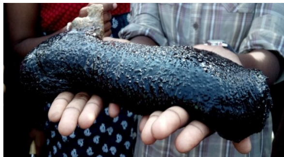
Fig.3. Holothuria leucospilota

Fig. 3 depicts the important morphological features of H. leucospilota . The features include elongated and snake like body. It is usually black in colour with randomly distributed long podia and papillae on the dorsal surface. Mouth is ventral with 20 large black tentacles. This sea cucumber species has a peculiar habitat of sticking its posterior end under the stone. When it is disturbed, this animal ejects thin Cuvierian tubules. Calcareous ring has characteristic large radial pieces with triangular interradials.