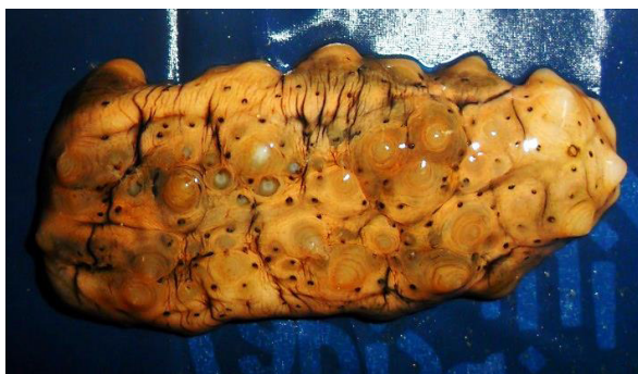
Fig. 5. Stichopus herrmanni

The detail photograph of S. herrmanni is given in Fig. 5. The distinguishable characters of the species include light mustard yellow colour body with numerous dark brown spots scattered all over the entire body. Podia are more prominent ventrally. Mouth is ventral which is surrounded by a circle of conical papillae and 20 brown tentacles. When the animal is out of sea water the body wall disintegrates after a few hours. Cuvierian tubules are absent. Calcareous ring characterised by deeply indented radial pieces and small interradials.