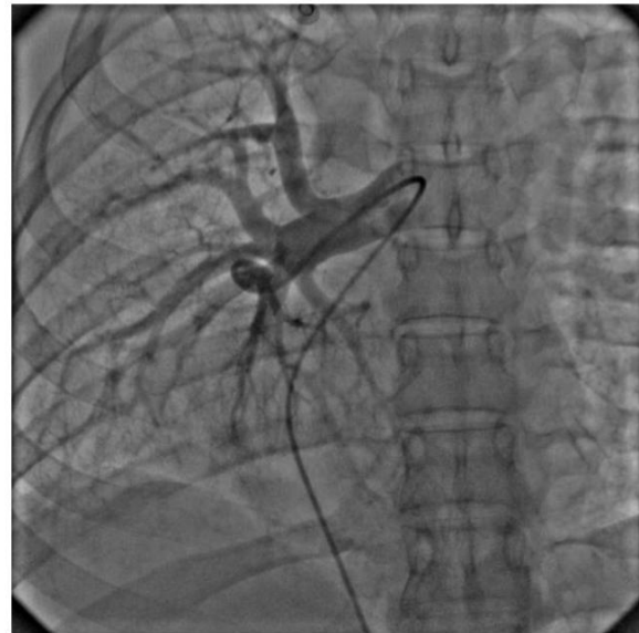
Figure 2a- RPA angiogram showing hypoplastic branch pulmonary arteries

She was referred to a specialized center for cardiothoracic surgery, underwent successful surgical correction and had an uneventful recovery.